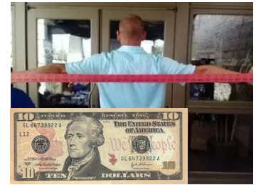
$10 for BOTH Arm's Length

Winner takes home half of the total , and the other half supports ALS patient services.