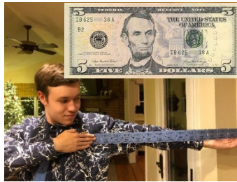
$5 for One Arm's Length